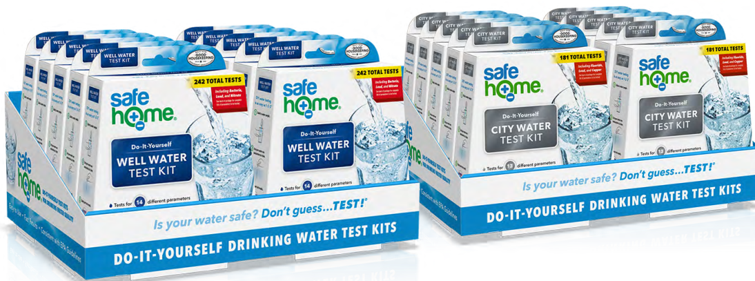
Pre-packed 10 ct Shelf Display Dimensions: 12.25" w x 7.25" h x 9" d